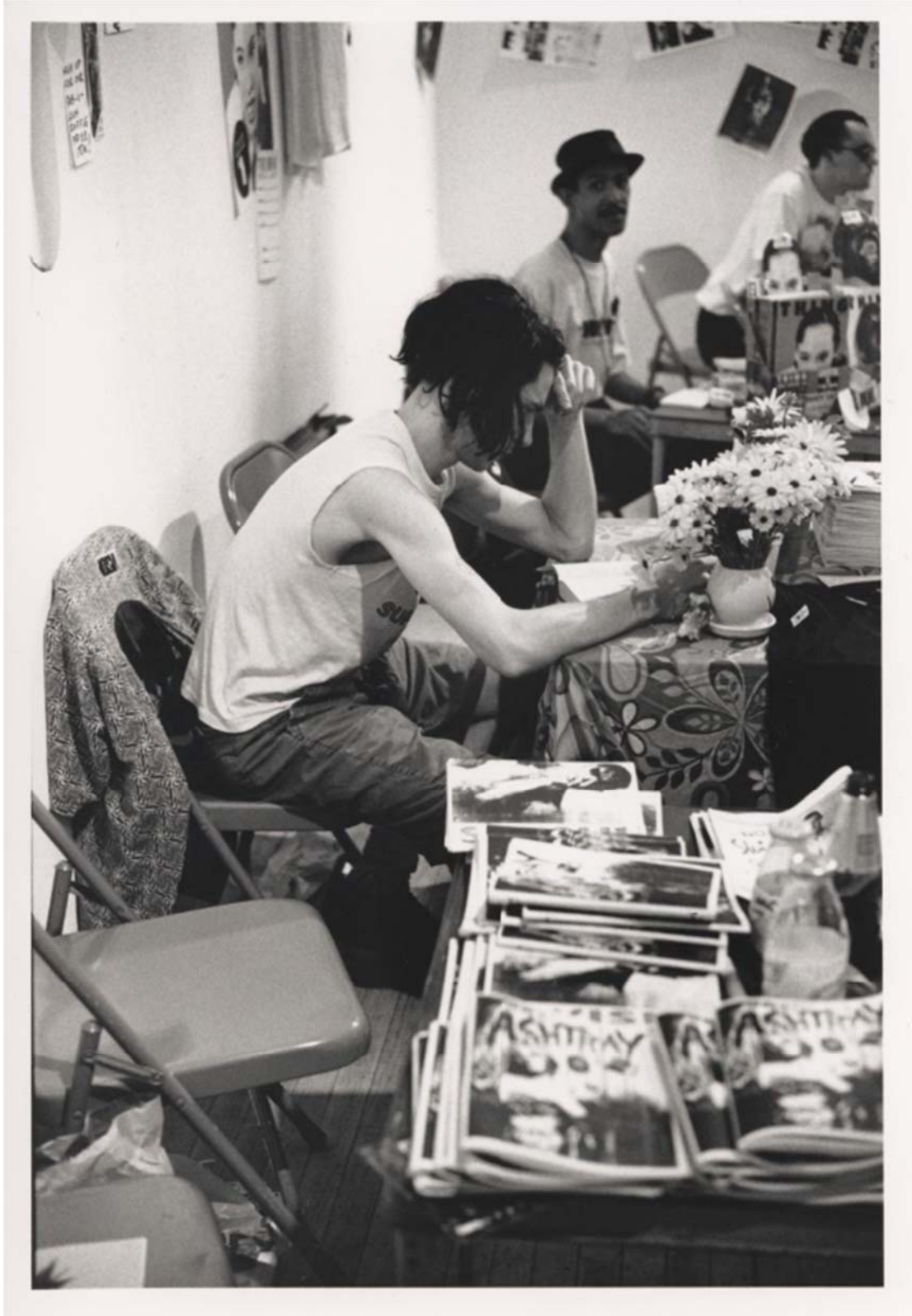
From the Randolph Street Gallery Archives, School of the Art Institute of Chicago