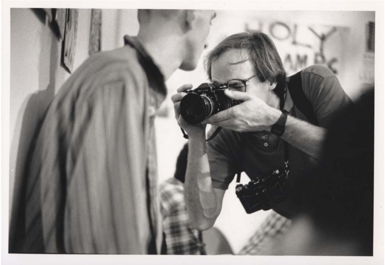
From the Randolph Street Gallery Archives, School of the Art Institute of Chicago